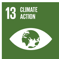
Protect the climate