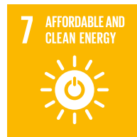
Use green electricity