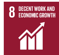
Responsible business practices